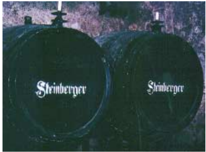
The VDP Rheingau auction is held at the famous Kloster Eberbach monastery, which is now a state-run winery.