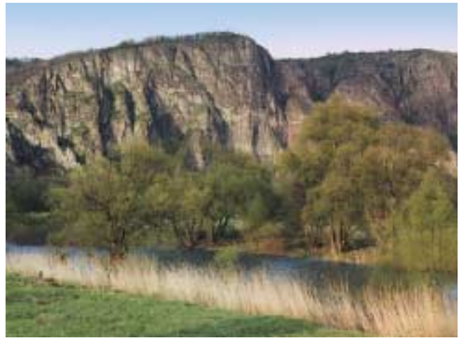
The dramatic Rotenfels ("red cliffs") of the Nahe valley.