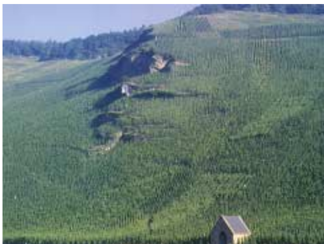
The great sundial vineyard of Wehlen (aka Wehlener Sonnenuhr) also produced brilliant Rieslings in 2001, including those from its most famous proponent, Joh. Jos. Prüm.

An aroma of very clean apple juice is deepened with the complexity borne of botrytis. It is immensely concentrated, with a palate-coating texture and terrific length. A fine acid thread maintains the elegant Prüm style. (36–750ml; 84–375ml; 2–1.5l) ★★★★★