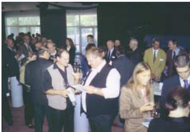
At the pre-tasting of the Bernkasteler Ring auction in Bernkastel. The pre-tasting is your chance to meet the winemakers and taste all of the wines before the auction begins.

Individual wine collectors in Europe also can go directly to a commissioner, but outside of Europe, the path for individuals is a little more circuitous. Of course, if you attend an auction personally, you can bid directly through a commissioner, though you'll still need to work out import arrangements. If you're only buying a few bottles, you can simply carry them home with you on the plane.