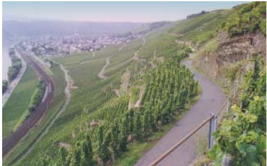
Steep, south-facing vineyards in cool climates, such as Winninger Röttgen on the Lower Mosel, provide Riesling’s best opportunity for an extended ripening period.

To appreciate how reflective of origin is Riesling, it is important to give some definition and boundary to the concept of terroir. Site specificity is at the core of terroir and its perceptible influence on the finished wine. It comprises an interrelationship of the natural environment at mesoclimatic and microclimatic level, pedology and geology as well as topography. The resultant wine and style is argued to reflect the impact of man’s choices within these natural circumstances. In its ideal proof, someone tasting the wine will taste and sense an appreciation of the wine’s origin.