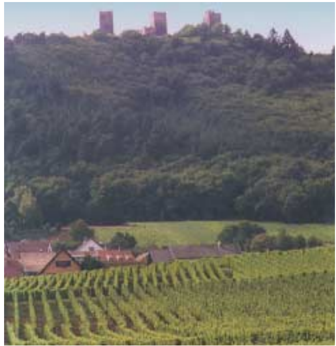
The vineyards of Alsace are protected by the Vosges Mountains to the west and contain a staggering array of soil types.

From the Australian selection, the wines showed consistent analytical parameters: alcohol 12-13%, residual sugars less than 4g/l, and acidities around 7 to 8g/l. The New Zealand example followed this pattern but had a little more residual sugar at 6g/l and this, to the author's palate, offered a more appealing balance between fruit, acidity and alcohol. The Tasmanian industry is at a very early stage in its evolution and the potential for Riesling was well highlighted. The Clare Valley examples showed more appreciably than the Eden Valley. Top producers have found the slightly cooler and more consistent climate better suited. All the examples showed the now-classic lime and lemon character, with Clare showing more sherbet and exotic fruit, Eden showing slightly broader, more open textured fruit. As a generalisation, the New World wines lacked the richness of expression of the Alsatian, Austrian and German examples.