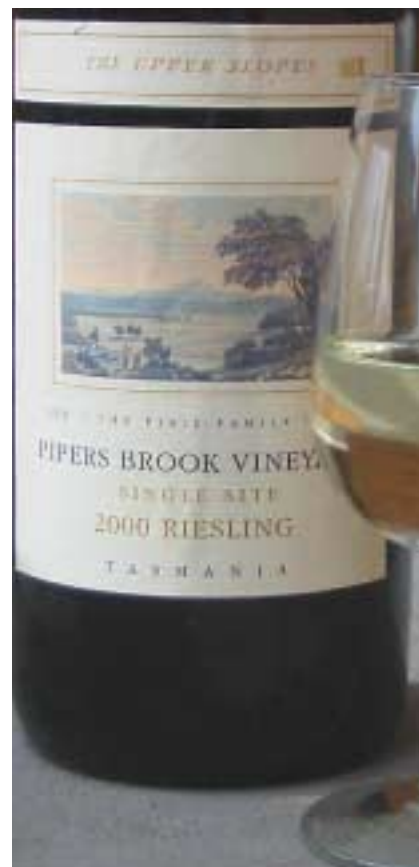
The new single-site Riesling from Tasmania's Pipers Brook Vineyard.

In warmer years like 1994 and 2000, the vineyard's wines are cast in the citrusy 'big island' mould, and with age become toasty in the manner of South Australia's Clare Valley Rieslings. In cooler years, they are fresher, more vibrant and minerally, and eventually develop the honied aromas and flavours redolent of Alsace or Germany's Rheingau. Almost regardless of vintage, the variety's charac-