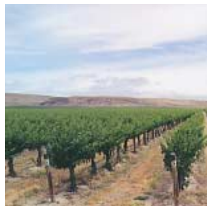
Vineyards of eastern Washington, birthplace of Eroica, the collaboration between Chateau Ste Michelle and Dr. Loosen.

Appearance: Gold Aroma: Botrytis, clean, tropical fruits and apple-pear notes Palate: Medium-full body, sweet, deep and earthy. Acidity is buried somewhere beneath the crushing weight of this ultra-Auslese. Finish: Very nice length, mineral-packed Comments: Excellent now, and one for the cellar.