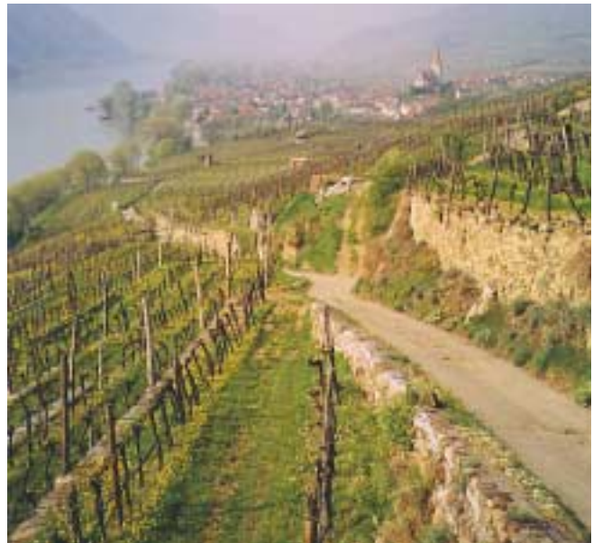
The tasting compared the stylistic differences between Rieslings from all over the world, including from the terraced vineyards of the Wachau district of Austria.

Comments: Tight, needs a few years to open. Very good.