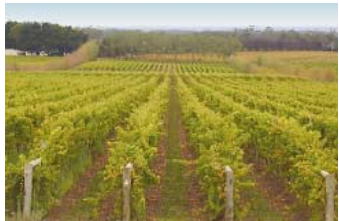
Vineyards at Drumborg.

Seppelt Great Western Moyston Road Great Western Victoria Tel (+61) 3 5361 2239 Fax (+61) 3 5361 2200