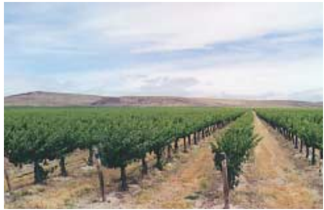
Chateau Ste Michelle's Cold Creek Vineyard, lies on the south side of the Columbia River, below Mattawa (see map on page 12).

The Eroica project has also had a significant impact on other Riesling growers in the Pacific Northwest, who now see that the wine-consuming public will pay