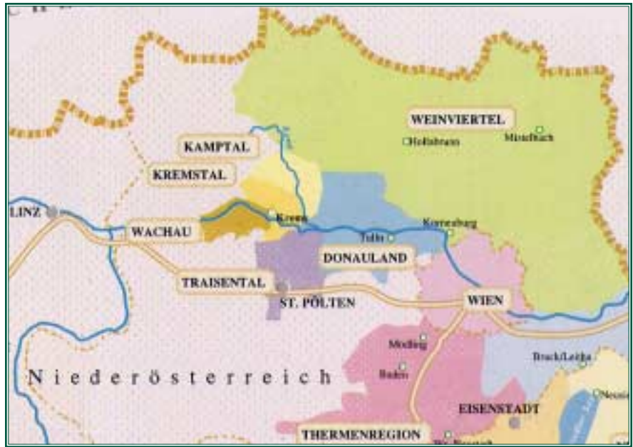
The northeastern corner of Austria, a region called Niederösterreich (Lower Austria) is where most of the best Grüner Veltliner is grown. The best of the best comes from three small wine districts: the Wachau, Kremstal and Kamptal.

Except for an occasional dessert wine made from botrytis-affected grapes, Grüner Veltliner is a full-bodied dry wine (up to 14% alcohol) with a firm mineral backbone, giving it the strength of character to work well with many cuisines. It is especially well suited to modern cooking that focuses on the fresh flavor of local ingredients and the variety is eagerly being embraced by creative chefs and innovative sommeliers around the world.