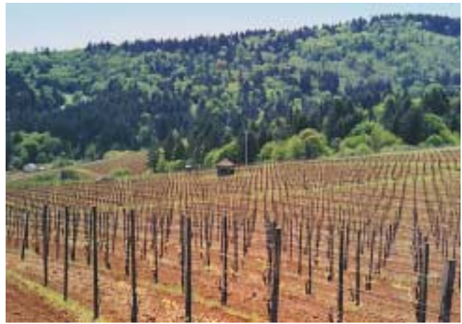
Holloran's Le Pavilion Vineyard, with its distinctive red Jory clay soil.

Riesling in western Oregon's cool, wet climate is a marginal business, but we are thrilled that a few die-hards are showing that the wines can be superb. Both Holloran and Brooks are working to get more Riesling planted in the Willamette Valley, and we're looking forward to better availability for their wines. It would be interesting, however, if someone were to plant some Riesling in the drier, warmer climes and lighter soils east of the Cascades. But perhaps it is Oregon's lot to always be thought of as that cold and rainy place out west.