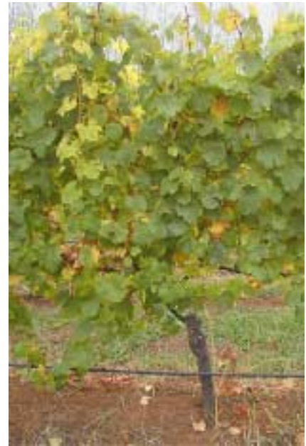
An old Riesling vine at Drumborg Vineyard.