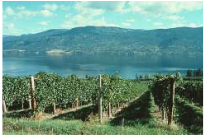
Vineyards in the Okanagan Valley of British Columbia, overlooking the long and slender Okanagan Lake.

The 1999 Riesling from Hawthorne Mountain is also quite interesting, with a burnished lime fruit aroma and a hint of brioche, something that comes with age in finer Alsatian Rieslings. There's quite a lot of acidity here, however, so give this wine some time in the cellar or try it with something strong like smoked meat.