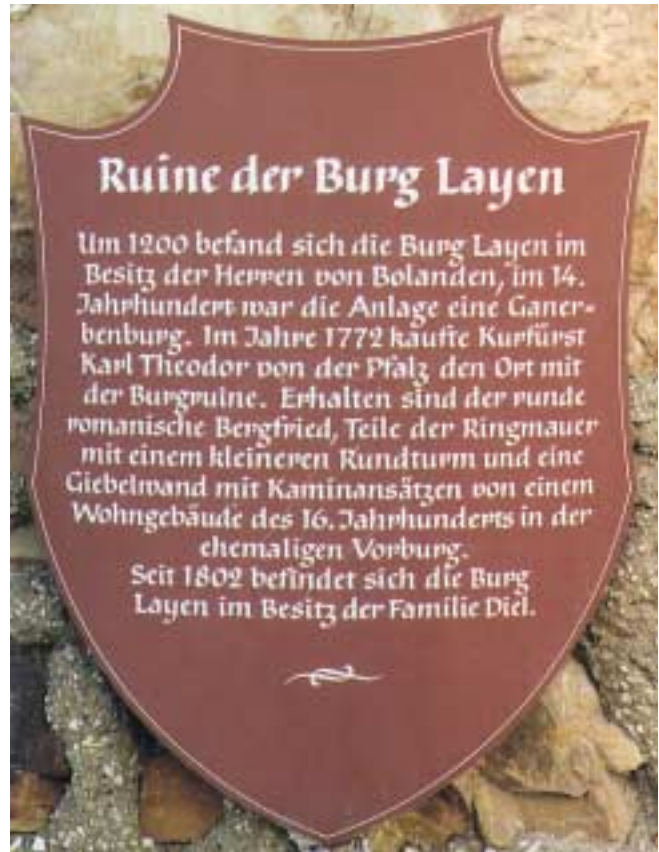
This placard recounts the history of Burg ("castle") Layen since it was built in the 12th century. The last sentence states that the castle has been owned by the Diel family since 1802.