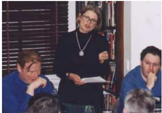
Long-time Riesling supporter Jancis Robinson MW leads a seminar for the wine trade at London's "Great Riesling Tasting" in February.

What was most interesting to hear was just how seriously the Australians take their Riesling. For winemakers there, producing a great Riesling has become something of a rite of passage. It's the way to prove yourself as a vintner and the