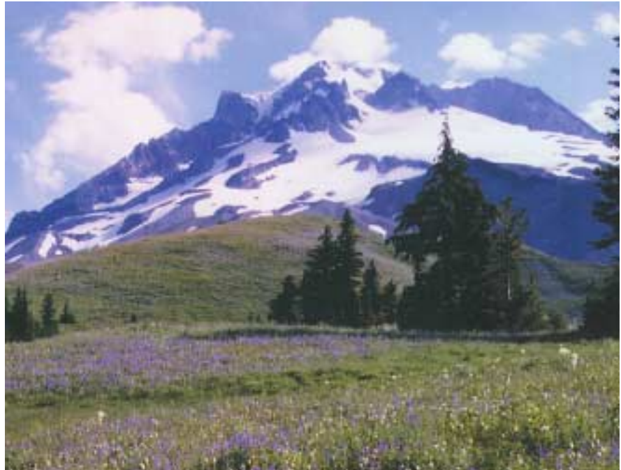
Oregon's Mt. Hood is part of the Cascade range, which divides the western third of the Pacific Northwest from the larger eastern part where most of the wine is grown.

The biggest problem for Riesling in the region has been overcoming the cheap and simple reputation that is still holding on from forty years ago. It has so permeated the cultural consciousness that even the winemakers have long assumed that Riesling is just a commodity grape for producing weak, overcropped slurping wine. The global image of Riesling is steadily improving, however, and a number of young, energetic winemakers are driving a quality revival throughout the Pacific Northwest. There is still a lot of mediocre Riesling produced, but finally we have some excellent wines to talk about as well.